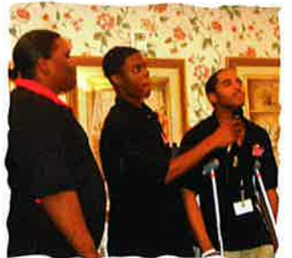
Youth Advisory Council members perform for seniors.