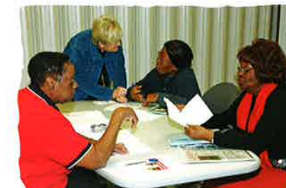
Seniors receive benefits counseling.