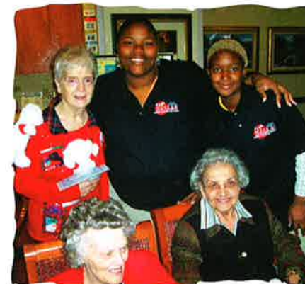
Youth Advisory Council members visit local nursing home residents.