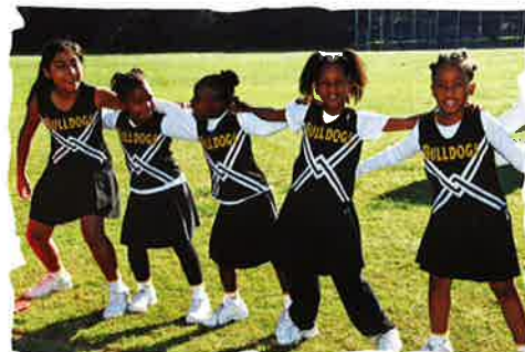
CYD "216 Bulldogs" cheerleaders cheer on their team at the Championship game!