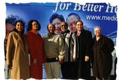
"Moving On Up" stars, Sherman Hemsley and Marla Gibbs visit with Dallas seniors.