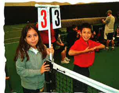
Students learn tennis in the Freeman Junior Development Program.